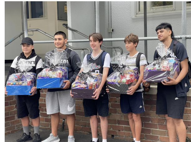
Recent winners at our Easter morning tea

To see a generation of young people in the St. George community come to know Jesus